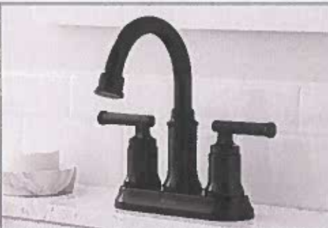
Oswell 4 in. Centerset 2-Handle High-Arc Bathroom Faucet in Matte Black 312295390