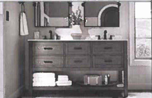
Tolbrook 60 in. W x 22 in. D x 35 in. H Double Sink Freestanding Bath Vanity in Brown Oak with White Engineered Stone Top 319537263