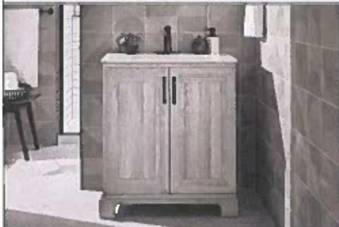
Sinita 30 in. W x 19 in. D x 34.50 in. H Single Sink Bath Vanity in Natural Oak with White Engineered Stone Top 319785653